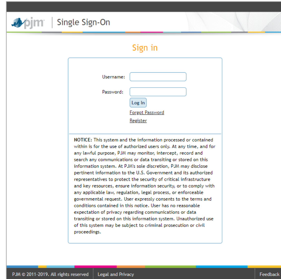
Ex. Windows Internet Explorer