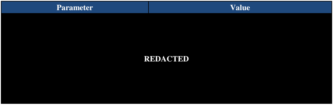
Table 5: Transmission Line Specifications

In summary, the proposed transmission line has the following specifications: