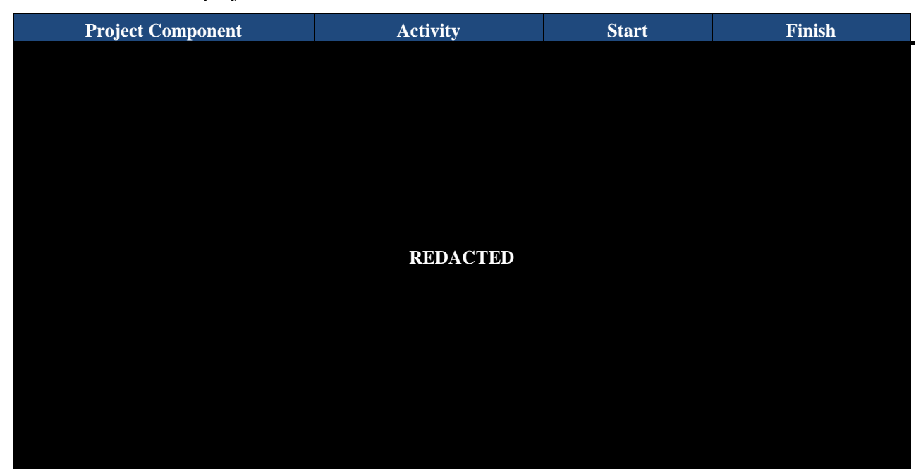
Table 3: Anticipated Timeline for the Juniata Substation 500kV SVC Project

Listed below is the timeline for construction of the Juniata Substation 500kV SVC Project. The estimated project timeline is 34 months.