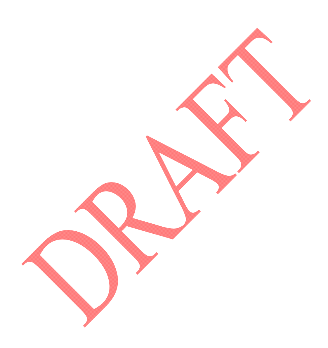
Tariff, Part VII, Subpart H Upgrade Requests