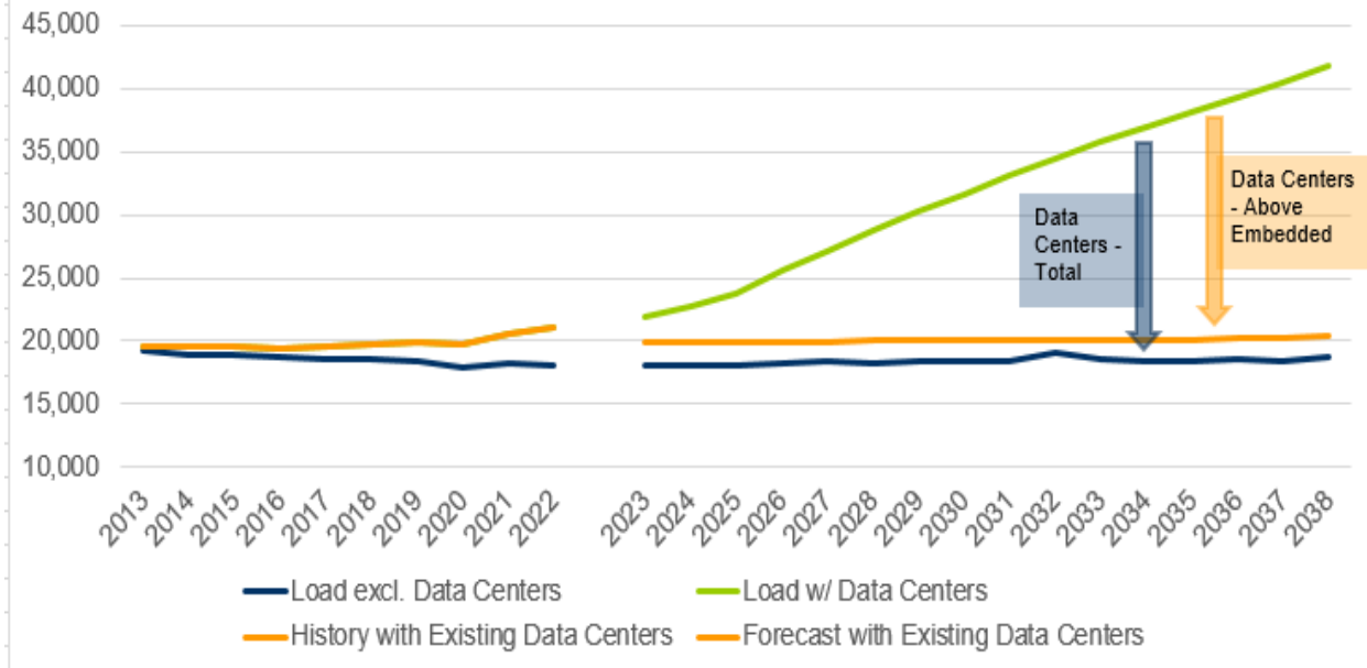
Dominion Summer Peak