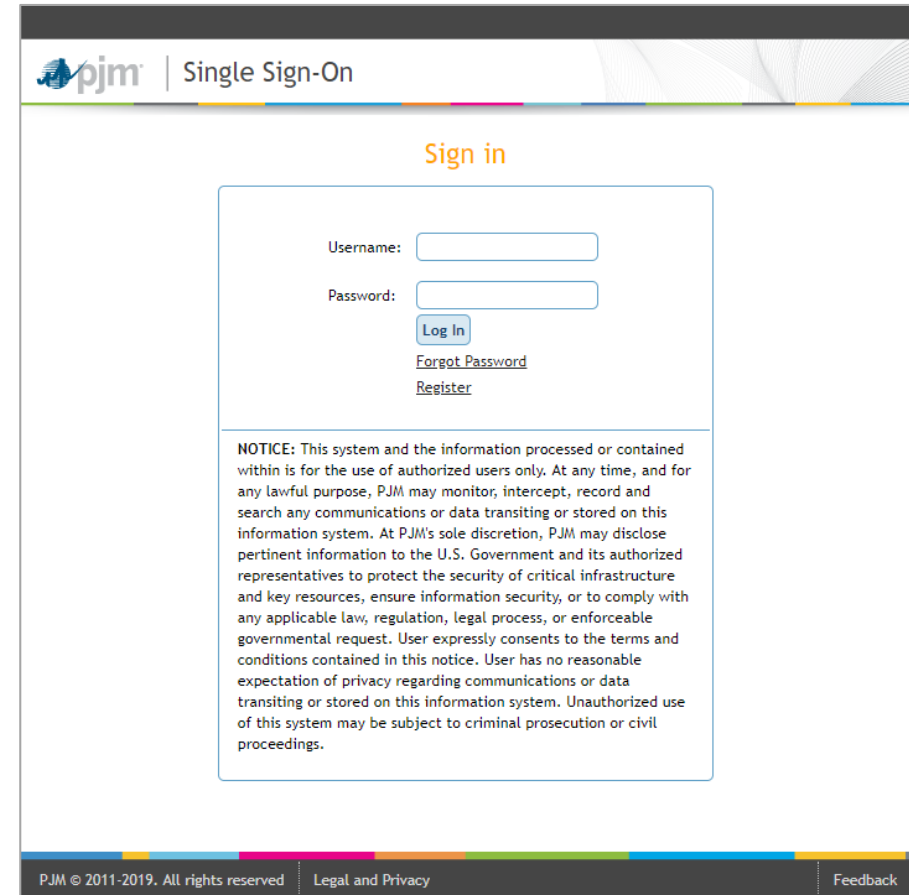
Ex. Windows Internet Explorer