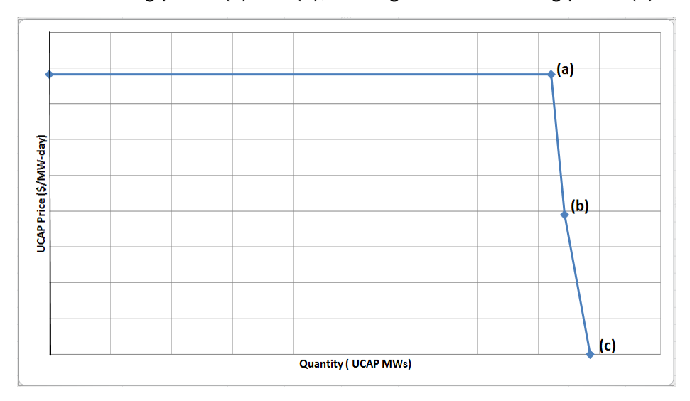
Exhibit 1: Illustrative Example of a Variable Resource Requirement Curve

The graph below illustrates the process for plotting the Variable Resource Requirement curve. The VRR Curve is plotted by combining a horizontal line from the y-axis to point (a), a straight line connecting points (a) and (b), a straight line connecting points (b) and (c).